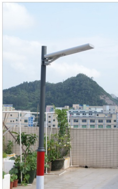
Hennan residential, China