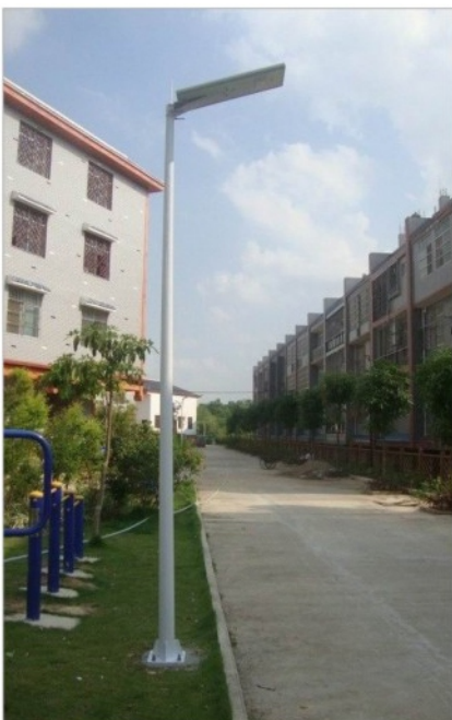
Shanxi new country side, China