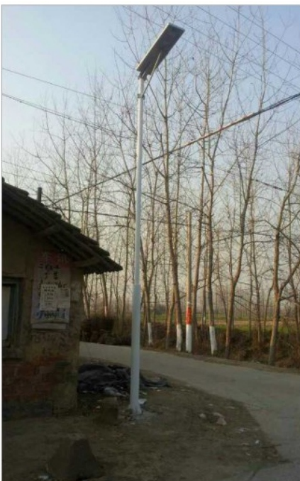
New country side, Sichuan, China