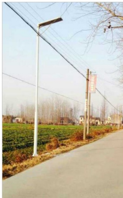
New country side, Hubei, China