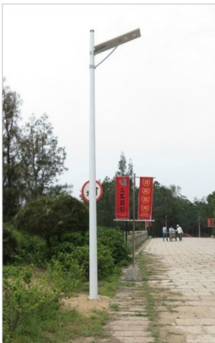
Country road, in Anhui, China