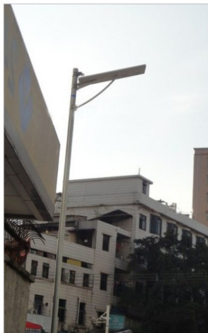
Industry zone, Yunnan, China