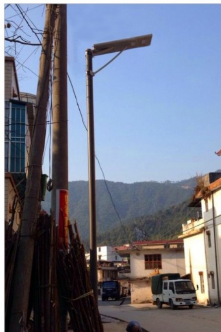
In Shandong, China