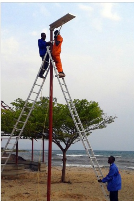
Seaside, in Africa