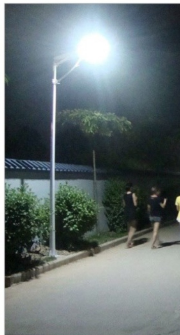
In Shanxi, China