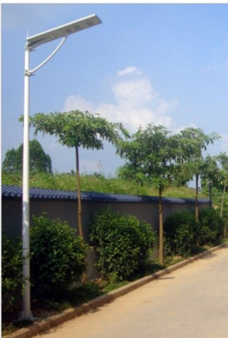
In Henan, China